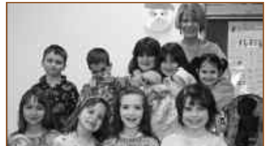
Making Reading Fun! Elementary students celebrate their extra reading efforts.

WHY VOTE? Because you can. In many nations of the world, and in many states of our union, citizens do not have the right to vote on the spending plans developed by their school districts. Because you set an example. The students we serve notice whether or not the adults in their lives exercise their civic responsibilities. We set an example whether or not we vote. Because you show respect for what educators do. Preparing students for success in life is a very difficult challenge for educators. By taking the time to vote, you acknowledge this challenge. Because your response is needed. Your school board has developed a spending plan based on input from district employees and community members. These individuals have spent countless hours considering options and making spending decisions for your consideration. Please respond by voting. Because your community and its children depend on you. The folk wisdom that "it takes a whole community to raise a child" fits here. You share the responsibility to see that all children are educated. While you may not be actually in the classroom, you can make your opinion known on what happens there by voting.